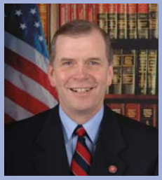
Congressman Tim Walberg

Since I began my first term in Congress last month, I've been asked numerous times if I feel the Republican Party has a problem with its "brand."