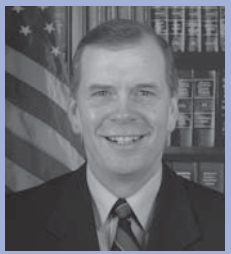
Congressman Tim Walberg

After Speaker Nancy Pelosi adjourned the House of Representatives August 1 for a five week vacation, I and several other members of Congress stayed