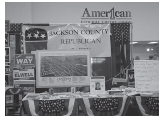
2008 Jackson County Fair Booth