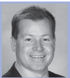
State Senator Randy Richardville

A mere 16 months after Governor Granholm and legislative Democrats led the charge for a $1.5 billion tax increase on Michigan residents and